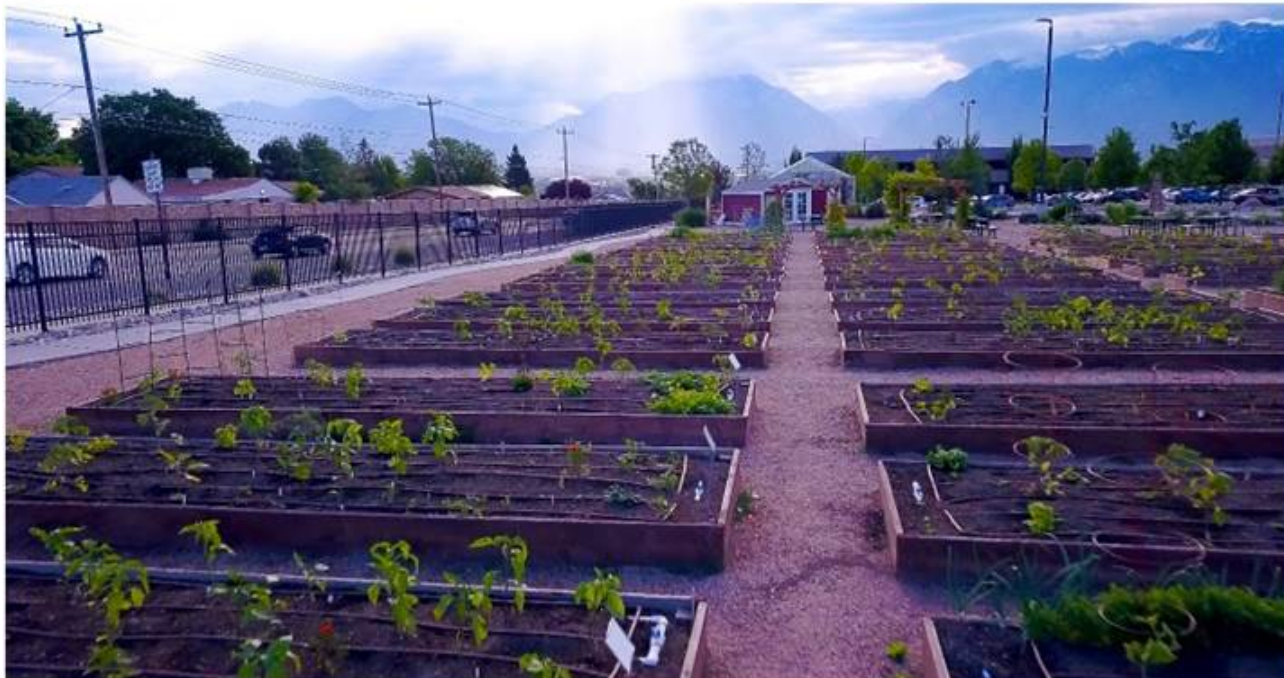
Merit Gardens. Merit has developed a one-acre parcel of land at its corporate headquarters in South Jordan, Utah, which offers 82 garden boxes, a small orchard of fruit trees and a state-of-the-art greenhouse for the benefit of its employees.

We have long recognized the importance of operating both a sustainable and profitable enterprise for the long term. We believe our operations should not compromise the environment or the economic prospects of future generations, and, under the direction of our Board, we have focused increasing attention on sustainability and reducing our global environmental footprint in our operations through reducing waste, energy conservation and reusing and recycling materials.